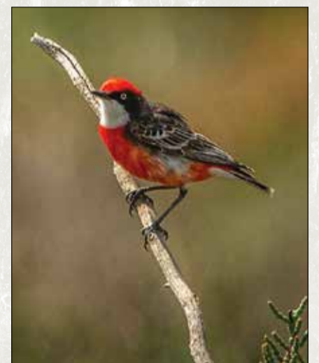
Crimson Chat ( Epthianura tricolor )

Often found in semi-arid and arid regions dominated by open shrublands, dunes, plains or grasslands, the Crimson Chat will move vast distances to visit the Goulburn Broken catchment when drought affects their inland food supply.