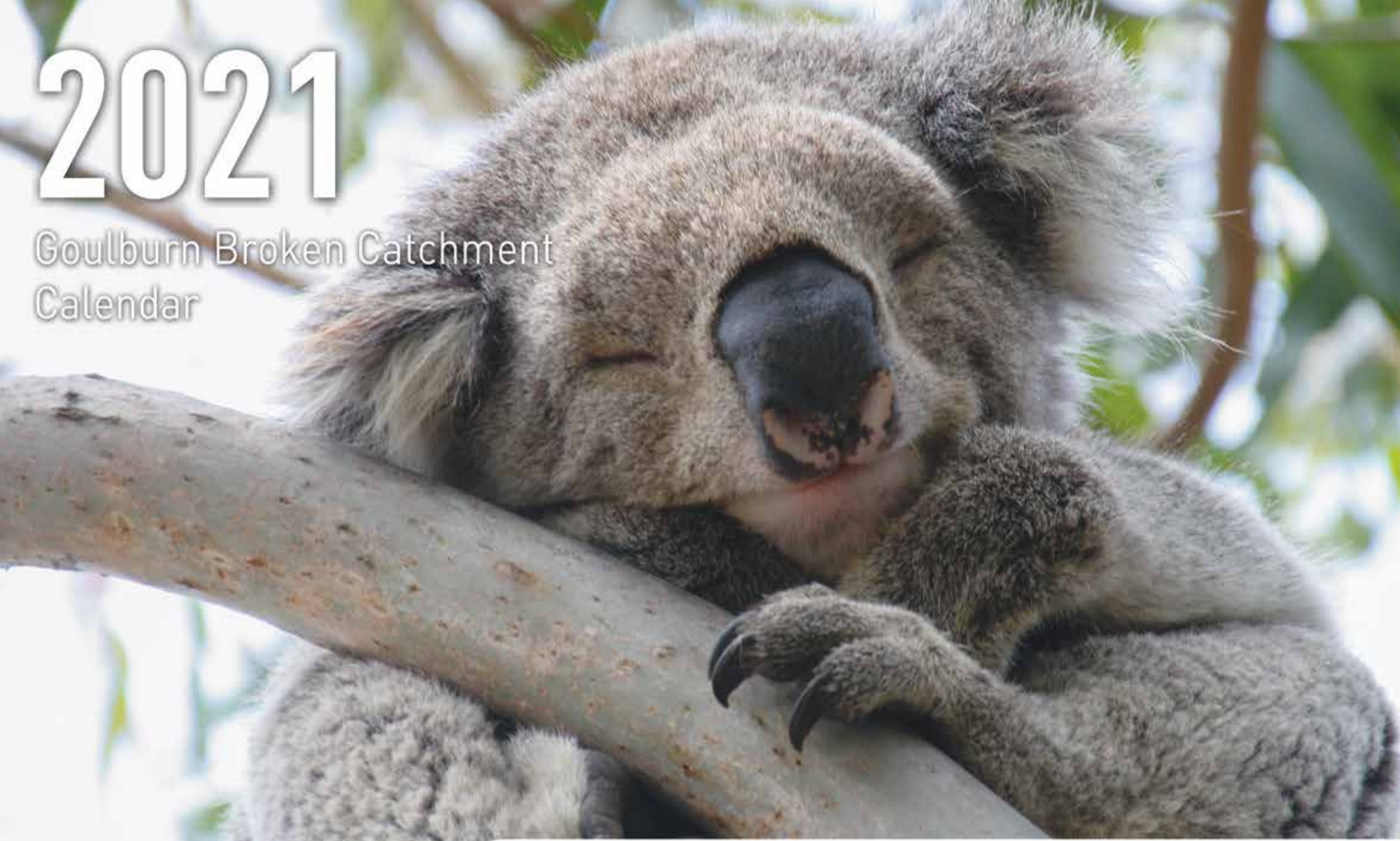
Koala ( Phascolarctos cinereus )